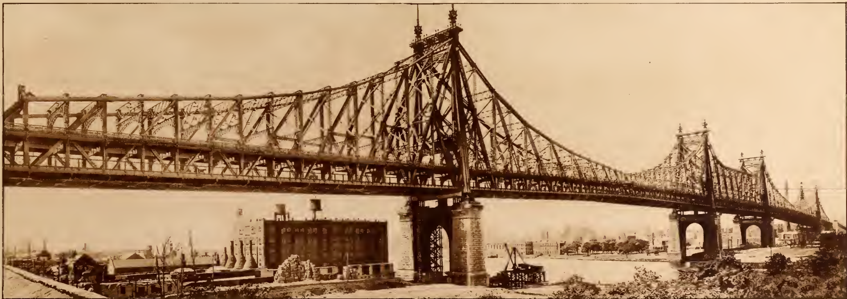
QUEENSBORO BRIDGE. The connecting link between Manhattan and Long Island, it carries a tremendous amount of traffic, leading into Long Island City